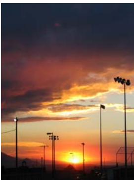
Sunset in our own backyard.