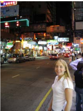
Hong Kong, at night.