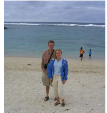
The beach during our trip to Mauritius.

Another organization in which I participate, NetImpact, held its annual conference this year in New York at Columbia University. Several other students and I traveled back there for several days and enjoyed all the excite-